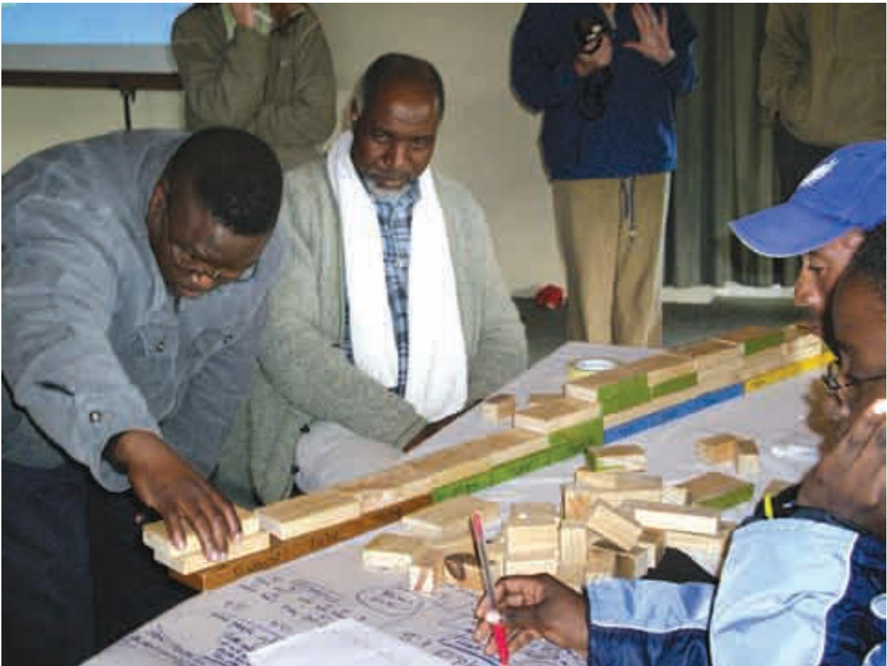
Groups discussing water demand over a year during the first Companion Modelling workshop with the Kat River Water User Association.

Kat River catchment follows a scientific posture called Companion Modelling (ComMod). According to this approach, "Stakeholders learn collectively by creating, modifying, and observing simulations. When carrying out simulations, one acts on the decision-making process by creating or modifying representations. ComMod leads stakeholders to share representations and simulations taking into account possible decisions and actions (management rules, new infrastructures, etc.) that are under consideration within their own environment. Simulation accompanies an iterative research process that is specific to each situation. The endless following cycle field work-> modelling-> simulation-> field work again, etc. corresponds to this concept. This leads to a diversity of models and methods, each contributing to a new kind of relationship between the simulation, the research itinerary, and the decision-making process" (The ComMod Group, 2004).