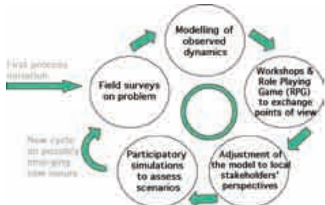
Figure 1- The Companion Modelling approach (adapted from Cirad, 2005)

discussed. The photo above shows participants using wooden blocks to build histograms representing their seasonal water use. This helped them to understand the computer generated graphs as part of the model output. Moreover, these representations of water used were incorporated into the next version of the model that was used in the second workshop.